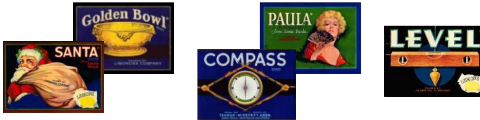
Historic Carton Labels dating back to 1893.

Limoneira Company Santa Paula, CA (805) 525-5541