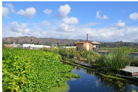
Water ponds uses patented technology that takes grey water and treats to CA title 22 drinking standards.