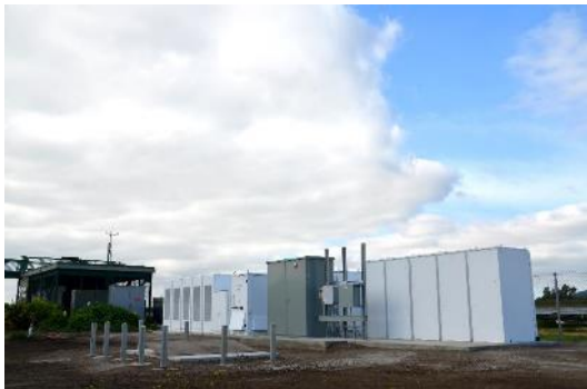
Tesla Project stores solar energy to minimize brownouts.