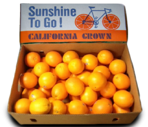
"Sunshine to Go" Fancy/Choice