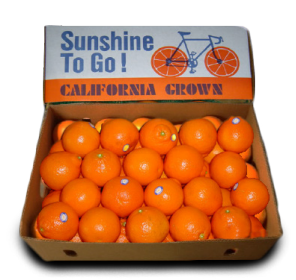
"Sunshine to Go" Fancy/Choice