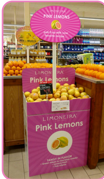
In-Store Display Unit With Recipe Tear Off Pads