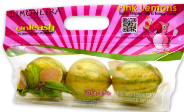
Retail Poly Bag