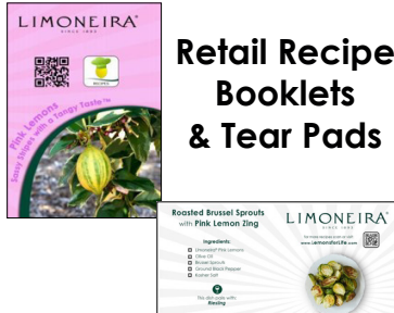
Retail Recipe Booklets & Tear Pads